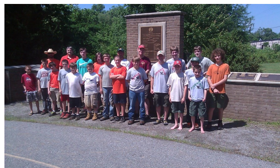
Wilkes District Old Hickory Council Boy Scouts of America The Annual Yadkin River Greenway Cleanup held in June