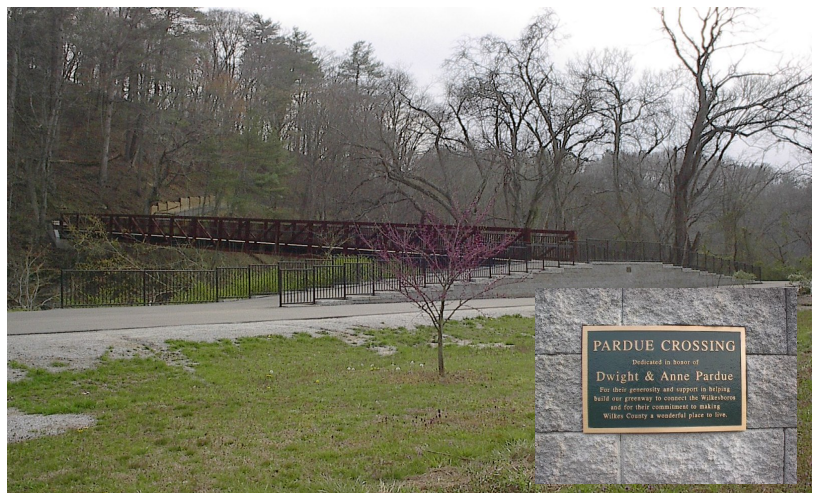
Pardue Crossing Bridge Across the Yadkin River

The entire news article is located on the Greenway's website. To view it go to: www.yadkinrivergreenway.com click on the photos tab, click on "In the News," click on the photos tab and then click on the "Pardue Crossing" window.