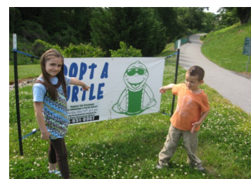
Gearing up for the Regatta!!!