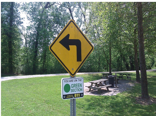
A typical 911 Sign

The Yadkin River Greenway Council, along with the towns of North Wilkesboro, Wilkesboro and the Wilkes County Communications Center have color coded all greenway sections for faster response to emergencies if and when they occur on the greenway.