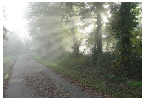
Greenway at Dawn

From birds and mammals to reptiles and amphibians, the Yadkin River Greenway is teeming with wildlife, stunning scenery and new discoveries! Come out and enjoy The Yadkin River Greenway!!!