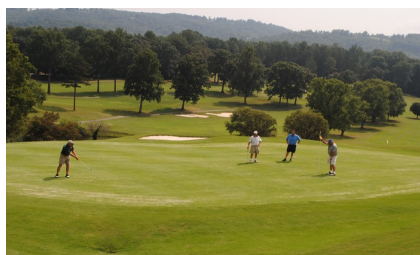
On The Green At Oakwoods!

The Yadkin River Greenway Council is a 501(c)3 charitable organization and donations are tax deductible.