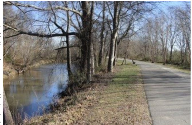
The Greenway Along The Reddies!

As you will discover in the following Committee Chairpersons reports, the Greenway has had many positive developments over the past year. I am pleased to report that many more are in the works! I promise you they are going to be exciting and the Council is looking forward to sharing the details with you as they develop.