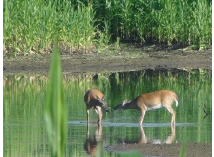
White Tailed Deer