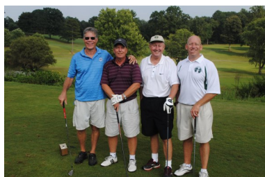
A Tournament "Team Moment"