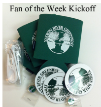
Fan of the Week Kickoff

The post that reached the most fans was the "Greenway Trinkets" post! It reached over 2,500 people in 7 days.